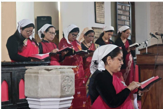
Ladies' choir at a recent Women's Fellowship Conference