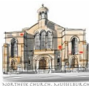
NORTHESK CHURCH, MUSSELBURGH